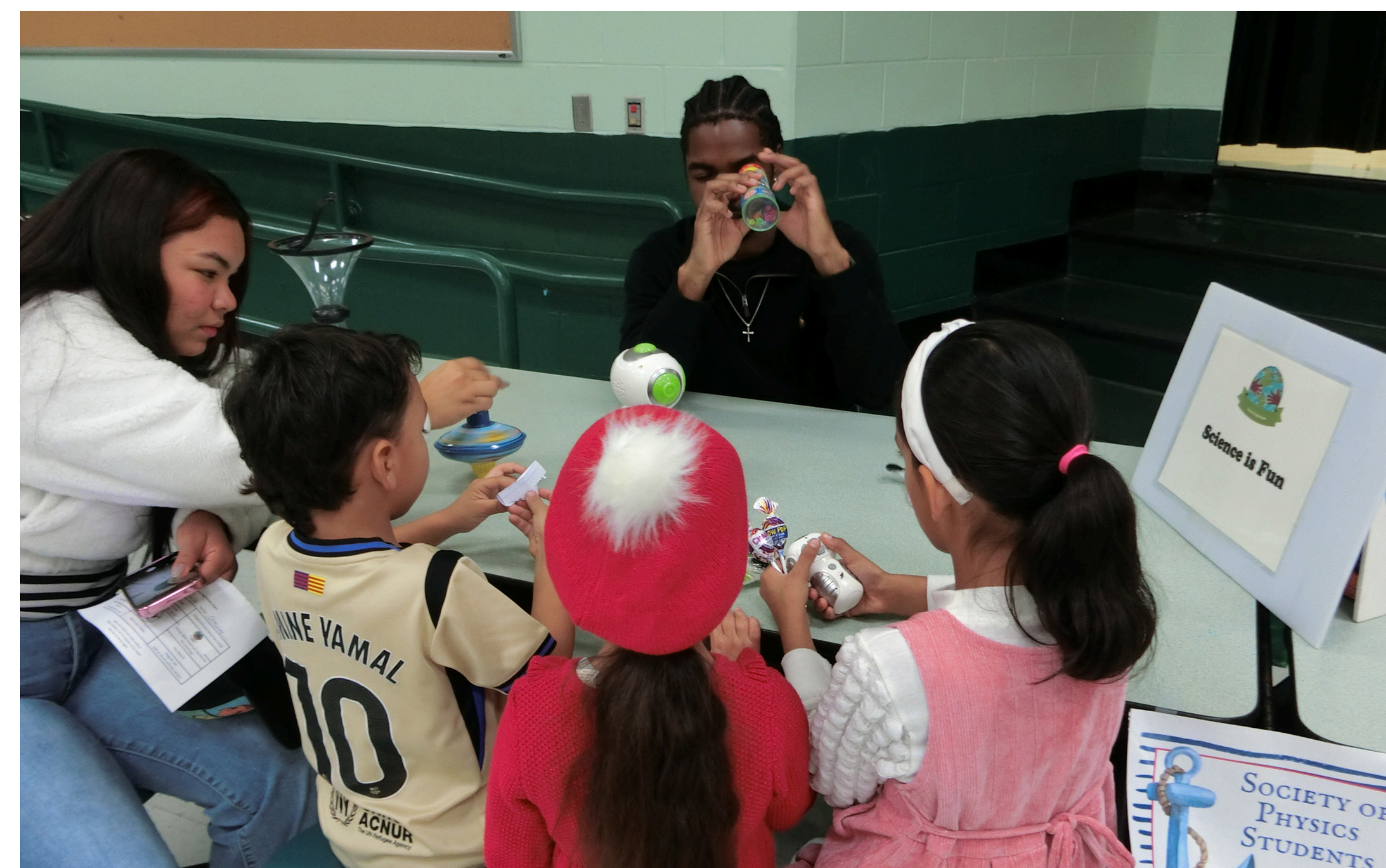
This photo features students at the Bond Elementary STEAM Night interacting with demos hosted by the Society of Physics Students.