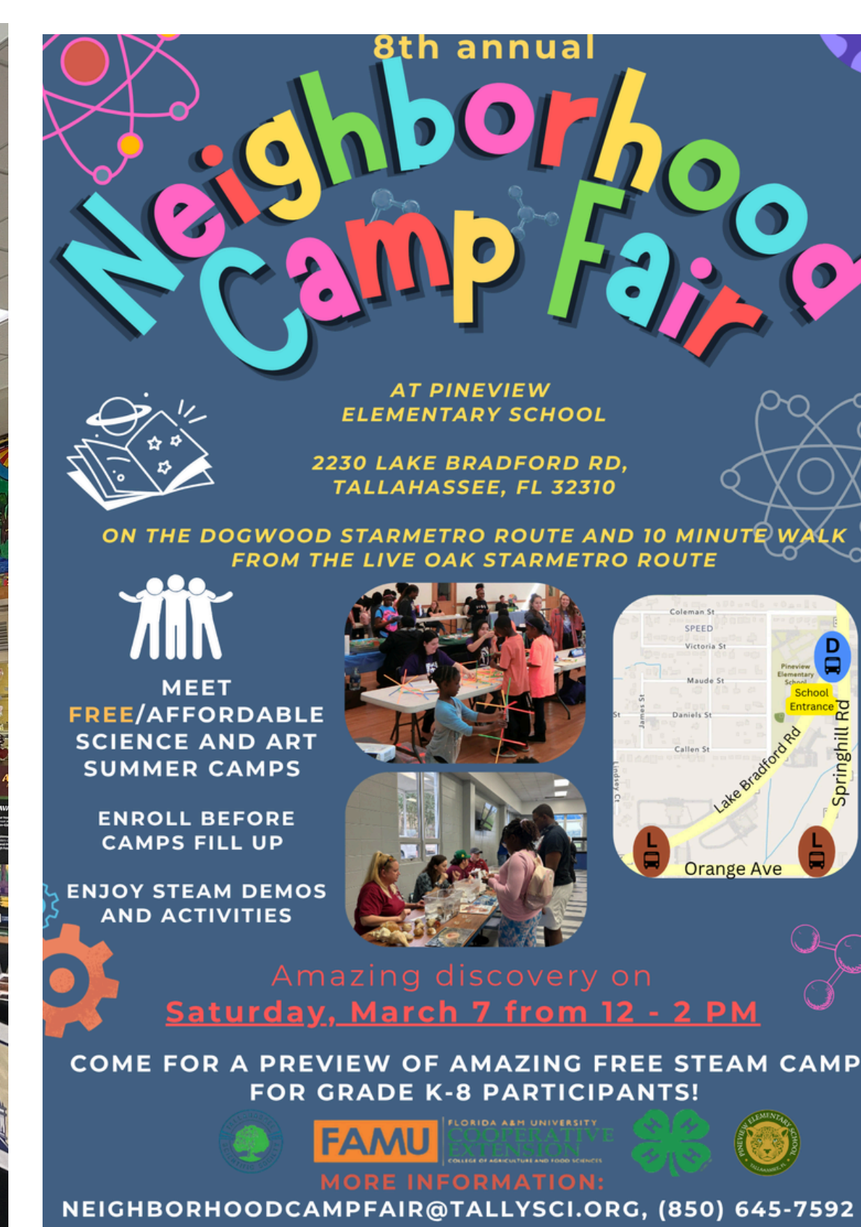
This year's Neighborhood Camp Fair flyer was distributed to families and local community members