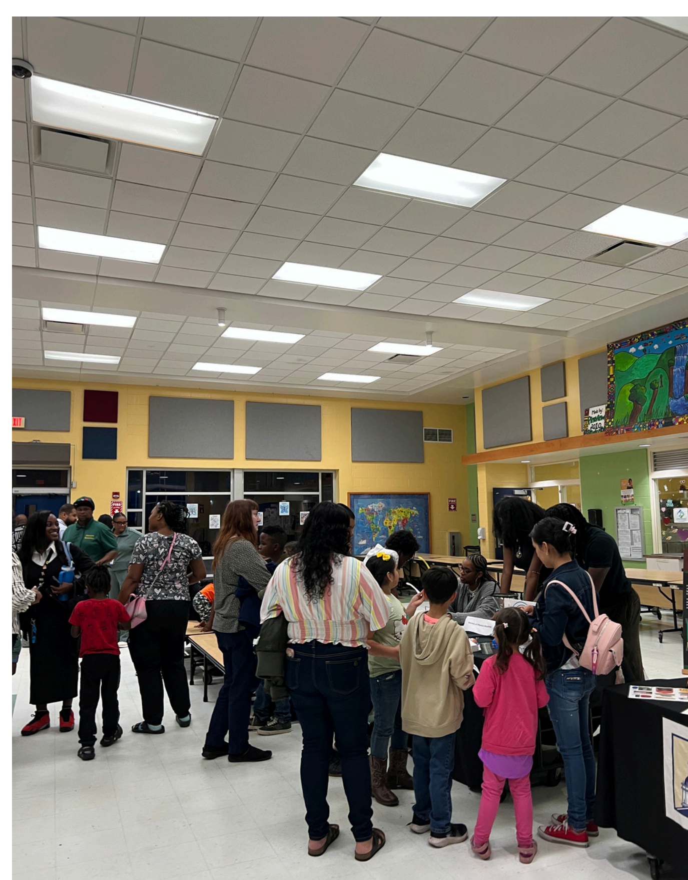
This photo features students at the Pineview Elementary STEAM Night